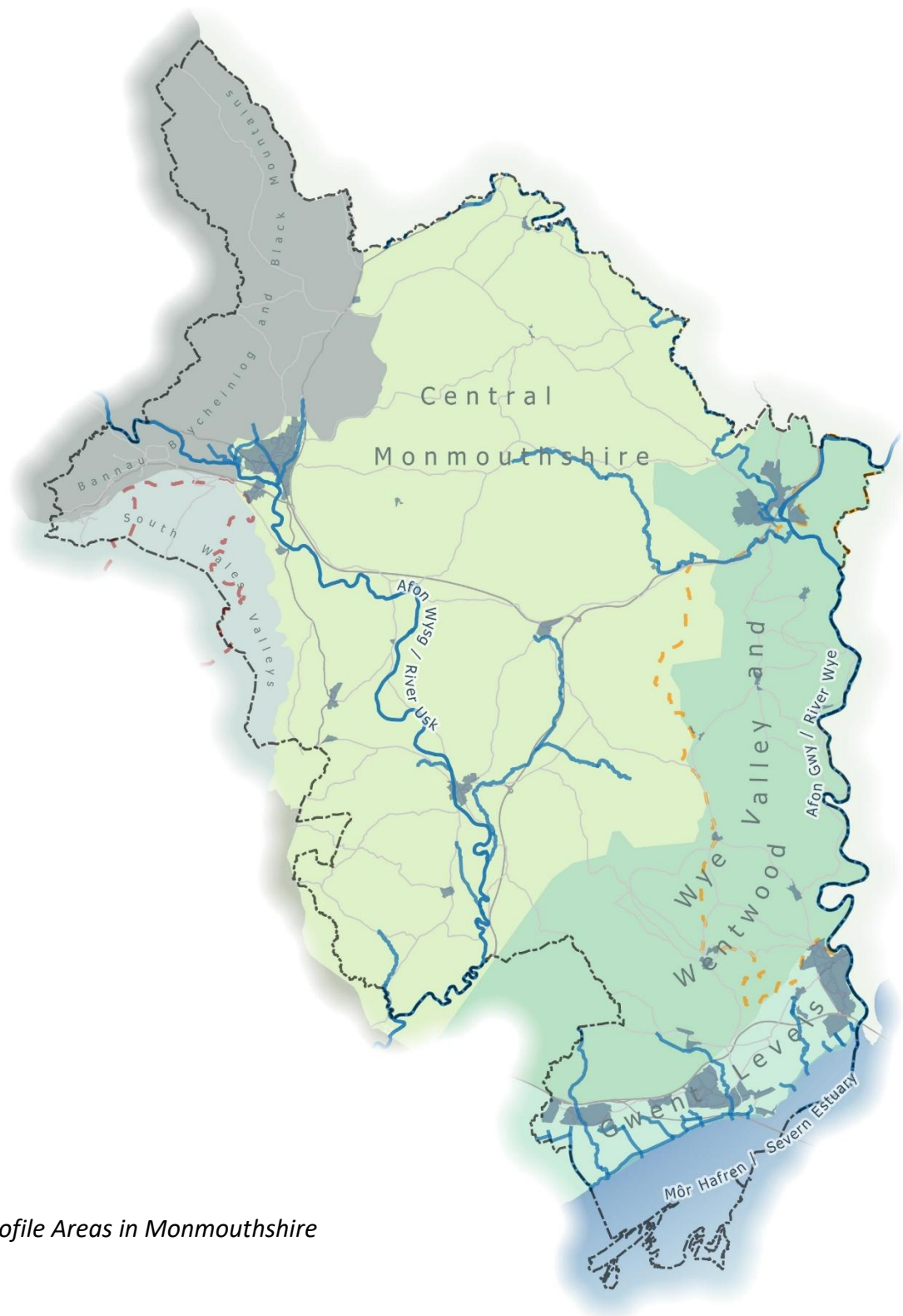
Landscape Profile Areas in Monmouthshire

The landscape profiles primarily share the same natural habitats but with clear differences which give them their distinctive character.