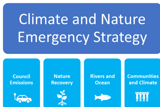
Figure 2 Climate & Nature Strategy planning

These significant changes in Wales, Gwent and Monmouthshire have triggered a need for a change in the governance structure around Climate and Nature. In 2024 this led to the declaration of a Climate and Nature Emergency with a revised approach based on four key pillars, as shown in Figure 2.