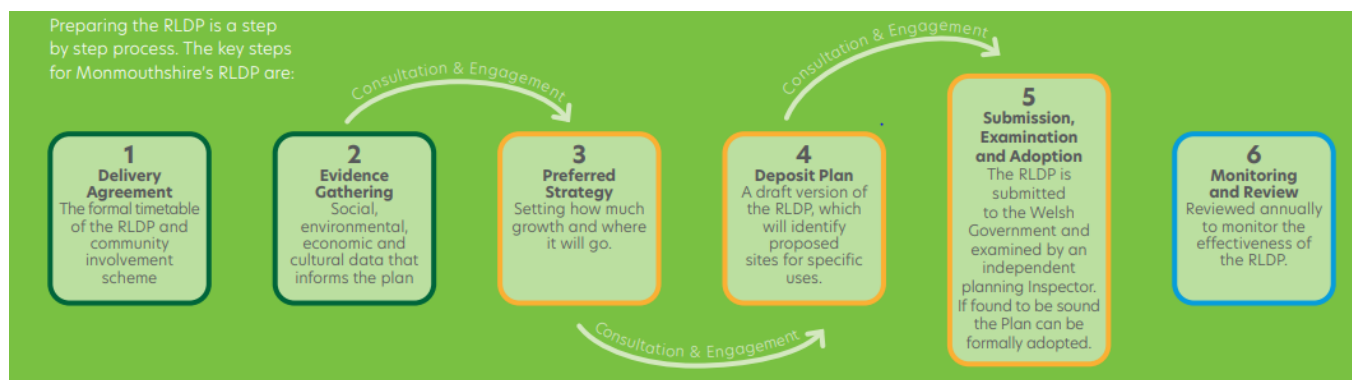
Figure 1: Key Steps in the RLDP Process

Council chose to engage from the outset and consulted on the issues, vision and objectives, and the growth and spatial options stages.