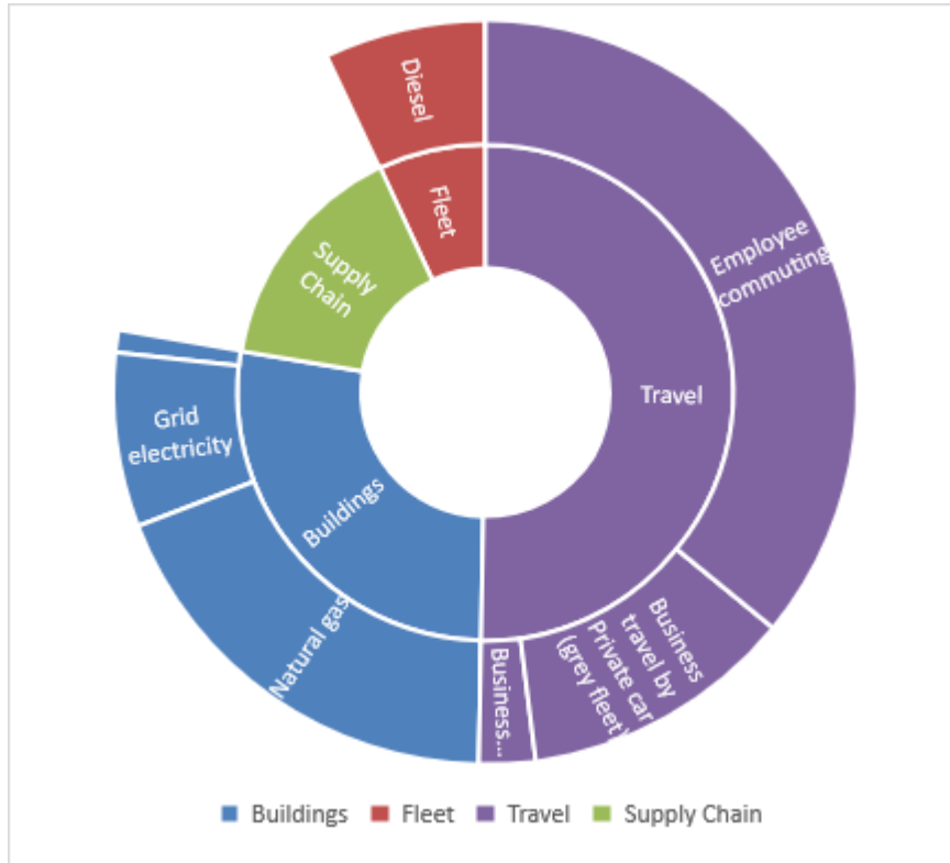
Wye Valley AONB Baseline emissions summary chart

opportunities to reduce their carbon footprint to identify realistic opportunities to achieve net zero.