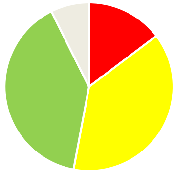
Progress on actions June 2020

■ No progress ■ Some progress ■ Good progress ■ Not yet started