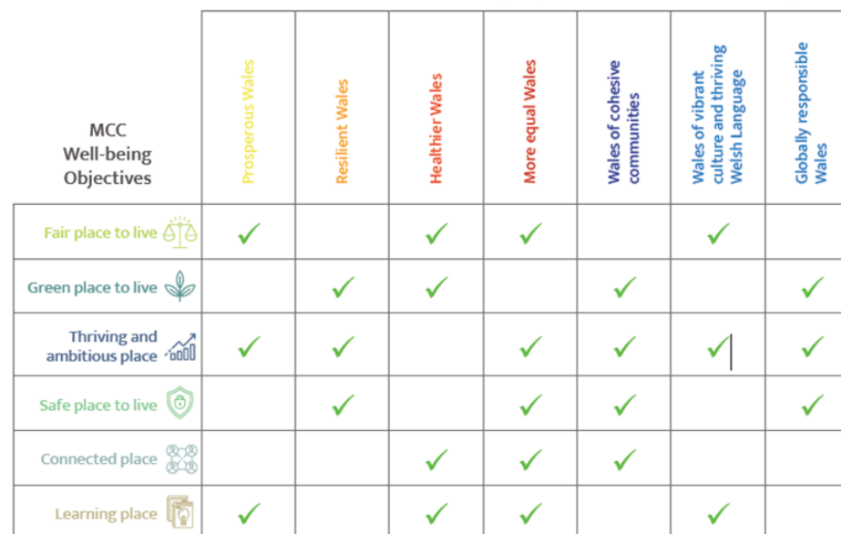
Contribution of Council Well-being Objectives to National Well-being Goals