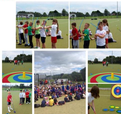
Castle Park Primary @CastlePark_Caid 09/06/2014 And #class4 enjoying being archers @leannejsport #monmouthshire #cpps more pictures to follow

We have exceeded our target of 80 new participants in our tots programme for the year. Work will be carried out